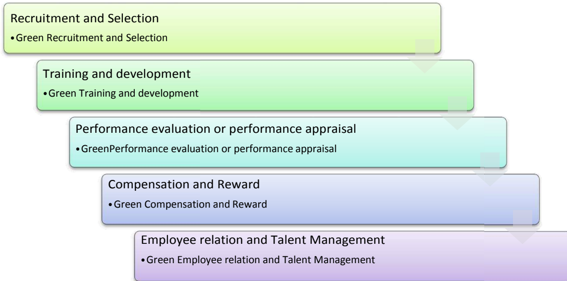
Figure 3: Convergence from HRM to GHRM

Green HRM is an agenda that cannot be achieved by merely ensuring the minimization of wastage or by going paperless. GHRM is a manifesto that helps in transforming the human asset of an organization in green human assets or green workforce, as discussed earlier. To create a sense of seriousness and to send a message to all the stakeholders and the society that how much passionate and responsible an enterprise is in conserving the environment and saving it from the climate change, that has become a serious threat to the humankind, it has to adopt green activities in the walk of the HRM systems and performance- from recruitment to retention, all activities must be aligned strategically with the go green agenda of the enterprise. A company can converge its HR activities towards Green HR activities in the following manner: