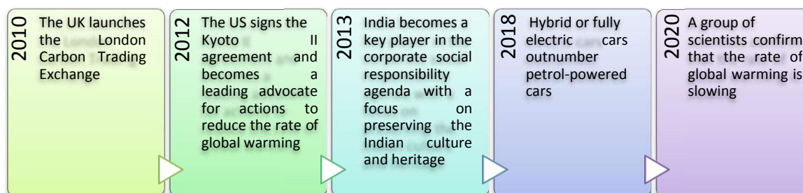
Figure 1: Journey of Green HRM

Companies develop a powerful social conscience and green sense of responsibility. Consumers demand ethics and environmental credentials as a top priority. Society and business see their agenda align.